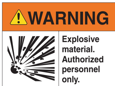
3,400 Predefined Safety Signs