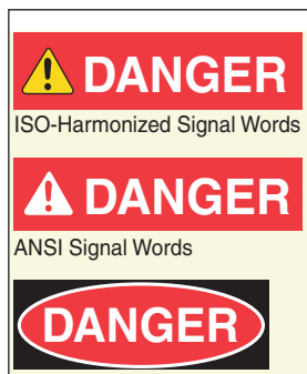
ANSI, OSHA, and ISO Signal Words